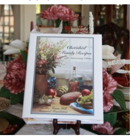
"Cherished Family Recipes, Anniversary Edition"

Attractive, hardcover ring binder containing 1,050 recipes from 124 contributors. Many recipes contain interesting information about the recipe or contributor. Most pages include quotes. Purchase a copy today! Contact us at (804) 590-1493 or